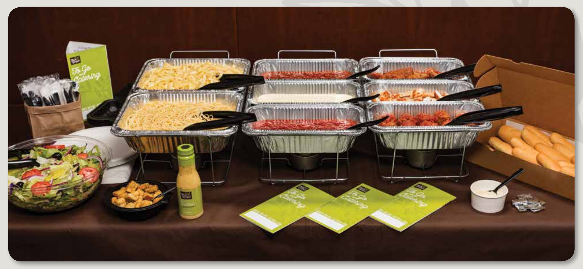
Pasta Station for 10 guests set up on a 6 ft. table

Our Catering packages come with everything you need to create a beautiful meal for your guests. Plates, cutlery sets, napkins, serving utensils, table covers, cups and ice are included with your order.